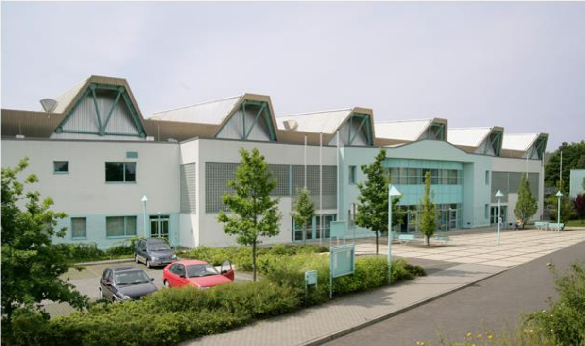
Picture 1: View of the Gymnasium Brandberge Halle (Saale).