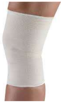
Knee bandage – 5.14 b2